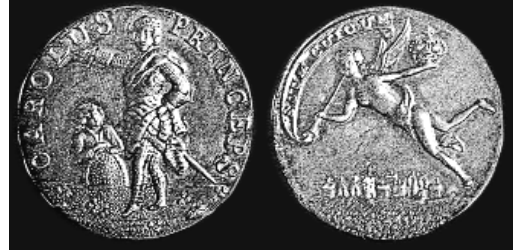
Figure 9. George II (1745) Æ, 1.4 inches. Obv : Prince Charles in highland dress points the way. Inscription : CAROLUS PRINCEPS. Rev : Fame flying with trumpets and crown over the fortified city of Edinburgh. Inscription on banner: SUUM CUIQUE (To each his own). MI 254 George II.

his Jacobite sympathisers. Disguised as a divinity student, he embarked on the eighteen-day journey to Scotland in two ships, but again misfortune intervened when they met the English ship HMS Lion. They were engaged and such serious damage occurred to the other of Charles' two ships that it had to return to France. Charles arrived at Loch Nan, Eriskay, Scotland on 25 th July 1745 with his famous Seven Men of Moidart and, despite initial resistance, established a base where supporters began to gather. Within a few weeks a small army had assembled, which then proceeded towards Edinburgh, increasing in strength en route . There was only minor opposition on the way, which was easily dealt with. Meanwhile, government forces under General Cope were manoeuvring to engage, but failed. Edinburgh was taken on 17 th September; Charles' father, James, was declared King of Scots (Fig. 9).