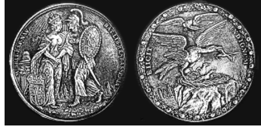
Figure 3. James II (1688) AR, 2.3 inches. Obv : The warrior Prince is welcomed by Britannia, his fleet in the distance. Inscription : M BRIT EXP NAV BAT LIB REST ASSERTA. (Great Britain delivered, restored and supported by the Navy). Rev : An eagle casting a young bird out of the nest [Prince James] with a fleet in the distance. The remaining eaglets represent the retention of James II's daughters by his previous marriage. Inscription : INDIGNUM EIICIT (It ejects the unworthy one). MI 73 James II.