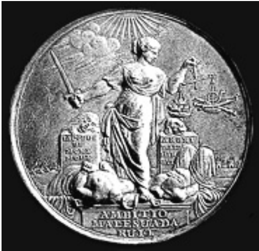
Figure 1. James II (1685) AR, 2.4 inches. This medal shows the standing figure of Justice trampling on the serpent of discord and commemorates the macabre events below. At her feet are the bodies of Monmouth and Argyle, their heads on blocks inscribed with their names. Inscription: AMBITIO MALESUADA RUIT (Ill-advised ambition falls).