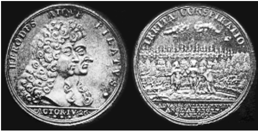
Figure 6. William III (1696) Ar, 1.7 inches. Obv : Busts of Louis XIV and James II. Inscription : HERODES ATQVE PILATVS (Herod and Pilate), likening Louis and James in trying to murder King William to Herod and Pilate plotting against Christ. Exergue : ACTOR IV 26. Rev : A netted enclosure of Louis and James with a purse holding 100,000 pistoles. A fleet in the distance. Inscription : IRRITA CONSPIRATIO (Fruitless conspiracy) [alludes to a plot to assassinate King William]. Exergue : ADVERS GVILIEL-MVS III ANGLIAE REGEM 3 MART 1696 (3 March 1696 against William III King of England). MI 414 William III.