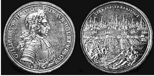
Figure 2. James II (1688) AR, 1.5 inches. Obv : Bust of William III. Inscription : GVILIELMVS III D G PRIN AVR HOL ETWES GVB. Rev : Prince William mounted at the head of his army on the beach at Torbay. In the foreground is a warrior raising the fainting figure of Justice. Inscription : TERRAS ASTRÆA REUISIT (Justice revisits earth). Edge : NON RAPI IMPERIUM UIS TUA SED RECIPIT (your power does not seize the empire but receives it). MI 64 James II.