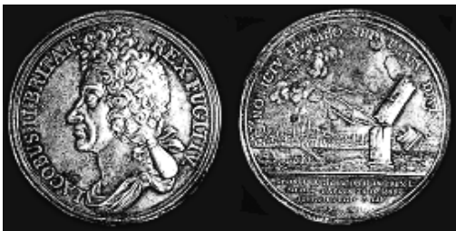
Figure 4. William & Mary (1689) AR, \mathcal{A} , 1.9 inches. Obv : A satirical bust of King James which shows him wearing a bag-wig [worn for travelling]. Inscription : IACOBUS II BRITAN: REX FUGITIV (James II King of Britain fugitive). Rev : Lightning issuing from the name of Jehovah [Hebrew] strikes a column on bank of the River Thames. Inscription : NON ICTV HVMANO SED FLATV DIVINO (Not by the blow of man but by the blast of heaven). Exergue : SPONTE FUGIT JACOB: II ANG: REX L. 20 DEC: CAPTUS 23 D. 1689. ITERUM FUGIT 2 JAN: 1689 (James II King of England voluntarily fled from London on 20 Dec 1688 taken 23 Dec [having been blown back] and fled again 2 Jan 1689).