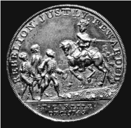
Figure 11. George II (1745) Æ, 1.35 inches. Inscription: REBELLION JUSTLY REWARDED. Exergue: AT CARLISLE (sic) DEC 1745.

Many medallions were issued to commemorate the fall of Carlisle, one of which is shown here.