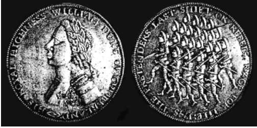
Figure 10. George II (1745) Æ, 1.35 inches. Obv: Bust of Duke of Cumberland. Inscription: HIS ROYAL HIGHNESS WILLIAM DUKE OF CUMBERLAND. Rev: Prince Charles at the head of his retreating army. Inscription: THE PRETENDER'S LAST SHIFT OR REBELS RACE FOR LIFE 1745. MI 263 George II.

just south of Derby, some 130 miles from London. Here, news arrived that an army was being formed at Finchley to block the advance but, in fact, this comprised untrained and poorly armed rabble. There was chaotic activity in London itself with shops closing and being boarded up, and the King preparing to evacuate. Secretaries of State, judges and civil servants generally were all preparing to switch their allegiances. Also, the Bank of England stopped issuing all monies except sixpenny coins to prevent a run on the currency.