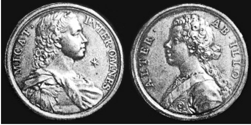
Figure 8. George II (1729) AR Æ, 1.65 inches. Obv : Bust of Prince Charles, the star indicating his princely origins. Inscription : MICAT INTER OMNES (He shines in the midst of all). Rev : Bust of Prince Henry. Inscription : ALTER AB ILLO (The next after him). Edge : DIE XXXI DECEMBR MDCCXX EXTVLIT OS SACRVM COELO. MI 34 George II.