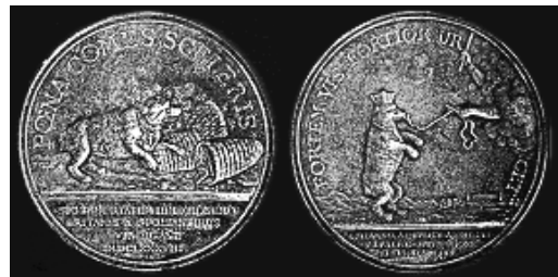
Figure 5. William & Mary (1689) AR, 1.9 inches. Obv : A bear [James II] being stung by bees from three hives [England, Scotland & Ireland]. The sting is a vote by the House of Commons on 28 Jan 1689 that excluded Roman Catholics from office, and the throne was declared vacant. Inscriptions : PENA COMES SCELERIS (Punishment the companion of crime). Exergue : SIC LIBERTATEM RELIGIONEMQ: BRITANNIA SPOLIANTIBUS VINDICANT. MDCLXXXVIII (The British avenge their liberty & religion from the spoilers 1688). Rev : A bear [The Pope] wearing a rosary and Jesuit cap is driven by the hands from heaven. Inscription : FORTEM VIS FORTIOR URGET (The strong a stronger power constrains). Exergue : BRITANNIA A DUPLICI ARBITRAR: PAPALIQ: OPPRESSIONE LIBERATA (Britain freed from oppression, etc). MI 16 William & Mary.