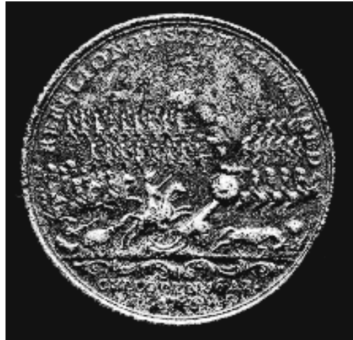
Figure 12. George II (1746) Brass, 1.4 inches. Inscription: REBELLION (sic) JUSTLY REWARDED. Exergue: CULLODEN 16 AP. 1746.

As with Carlisle, many medals were struck to commemorate the Battle of Culloden, and the one shown here is only representative of that long series.