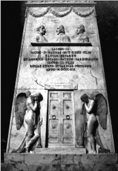
Figure 14. The marble monument, sculpted by Antonio Canova, that was placed over the graves of King James II, Charles Stuart and Henry Benedict.