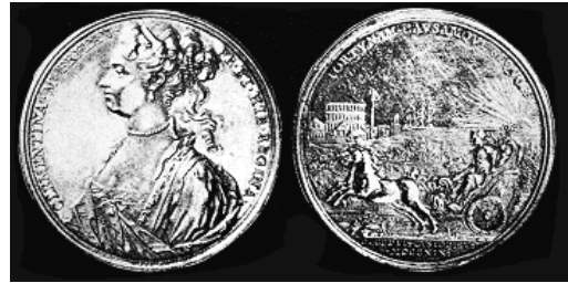
Figure 7. George I (1719) Ar, 1.9 inches. Obv : Bust of Clementina. Inscription : CLEMENTINA M BRITAN FR ET HIB REGINA. Rev : The Princess in a cart drawn at speed by two horses, rising sun and Rome in the distance. Inscription : FORTVNAM CAVSAMQVE SEQVOR (I follow his fortune and his cause). Exergue : DEC-EPTIS CVSTODIBVS MDCCXIX (The guards being deceived, 1719).