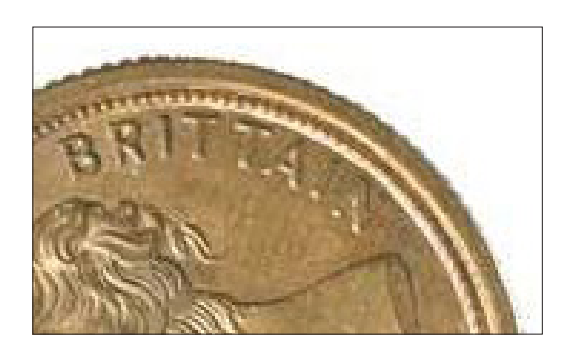
Detail of the double 'T' (Andrews 495).

Obverse: N. SHREEVE ADELAIDE. S.A round edge, IMPORTER / & / GENERAL / AGENT in four lines within. Reverse: Head of Queen Victoria in centre, VICTORIA QUEEN OF GREAT BRITTAIN round edge. 24 mm, brass, reeded rim. One recorded in copper, see (Spink Auctions (Australia) sale July 1988 lot 1773.