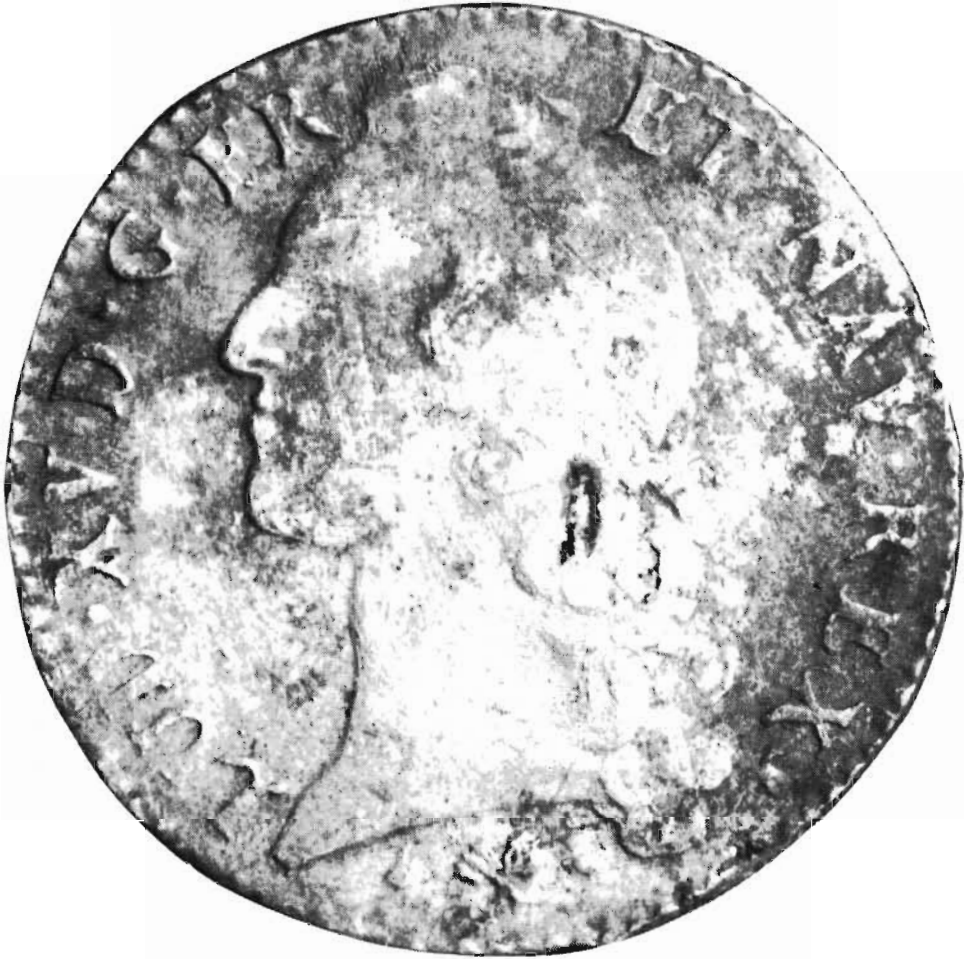
fig. 1 enlarged, actual size 42 mm

FOUND AT TURTLE BAY ON THE 16 TH JANUARY 1988