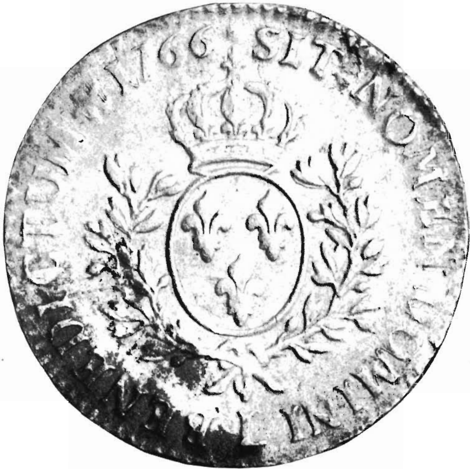
fig. 2 enlarged, actual size 42mm