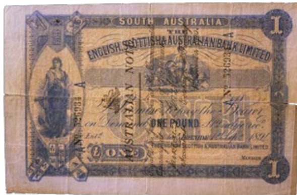
Figure 7, E. S. & A. emergency £1.

A year or so after the £1 notes commenced there was a shortage of note paper from England due to WW1. Two types of emergency £1 notes were locally produced. The first of these was an unused 1894 English, Scottish & Australian Bank Limited £1 overprinted in a similar fashion to the previous superscribed notes, but without the decorative panels and only two serial numbers instead of three, using serial numbers A (number) A and B (number) B, (Fig. 7).