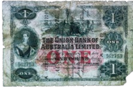
Figure 1, Union Bank of Australia superscribed £1 note.

issued after the issue of banknotes was taken from the control of private issuers and the Queensland Government. It took more than two years for the Commonwealth Treasury to design and produce the first of the new Commonwealth of Australia issues.