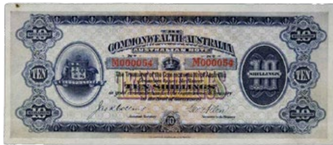
Figure 2, Collins/Allen 10/- M 000054.

Australian government-designed notes first appeared after 1 May 1913. Serial letters M to N were allocated to the 10/- notes, P to T for £1, U and V for £5, W for £10, X for £20, Y for £50 and Z for £100. The £1,000 note appears to be an afterthought using the pre-printed prefix “2A” (Fig. 3). It was only in public use for a short time until 1915 and then used for inter-bank settlements. The first 500 10/- notes were “presentation notes” balloted mostly to members of parliament, who paid for them.