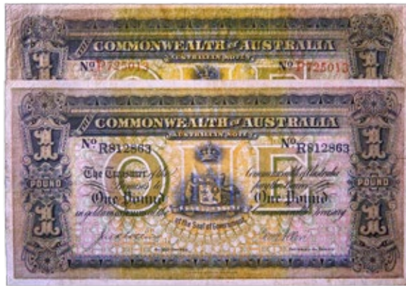
Figure 5, £1 Collins/Allen notes with red and blue serial numbers. One pound notes commenced with “P” prefix serial numbers in red, followed by Q, R, S and T with small blue numbers (Fig. 5).