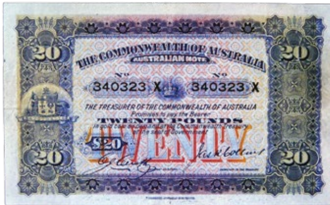
Figure 11, Cerutti/Collins £20, suffix X serials.

Treasury-issued £50 notes commenced with prefix “Y” for Collins/Allen and Cerutti/Collins notes, then ‘Y’ suffix in Cerutti/Collins before reverting to “Y” prefix and numerals in larger font.