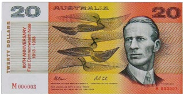
Figure 20, 80th anniversary of first Commonwealth note.

In 1988 and 1992 with the introduction of $10 Bicentenary and $5 polymer notes respectively, notes with the first date of issue overprint were produced in folders at a premium for collectors.