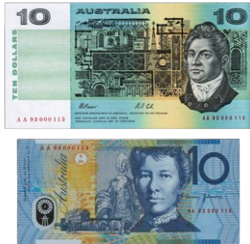
Figure 21, Last and First portfolio paper and polymer notes with matching serial numbers.

Fig. 21 illustrates $10 notes from the Last and First portfolio series issued from the $10 in 1993 to the $100 in 1996. The same serial numbers were in red on each note with the paper notes bearing polymer-type serial numbers.