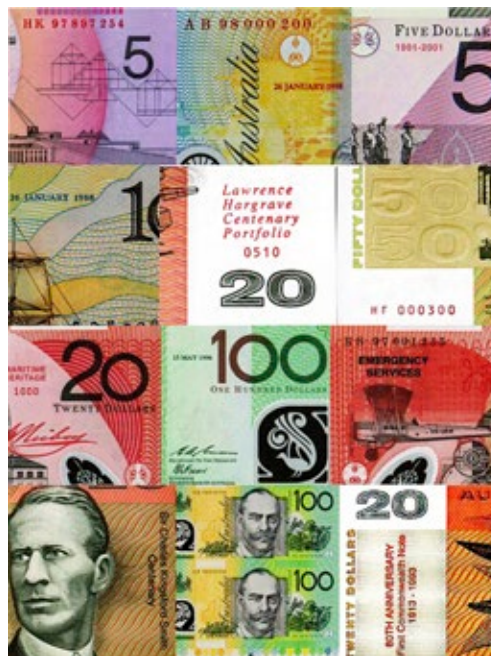
Figure 22, Australian modern numismatic banknotes.

There were many other collector notes issued, some in portfolios with stamps, one with a phone card and another with a coin. Some notes were overprinted and/or had out-of-sequence or special serial numbering and an annually dated low-number series (Fig. 22).