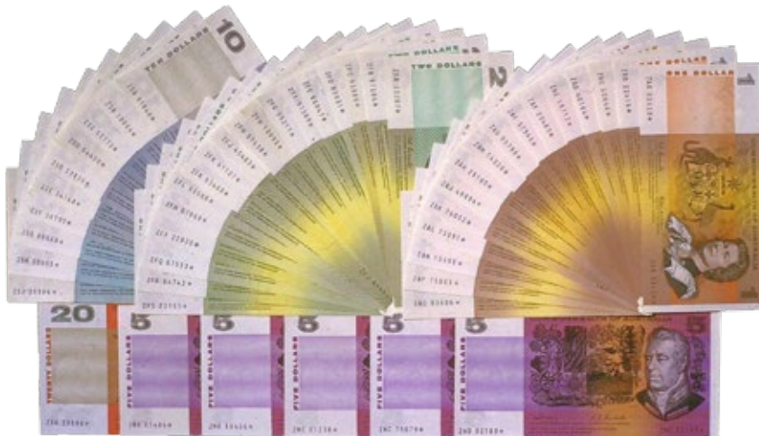
Figure 18, All 50 decimal star notes serial letter prefixes, ex-author’s collection.

Decimal notes commenced on 14 February 1966, with $1 at AAA, $2 FAA, $10 SAA and $20 XAA. $5 notes commenced in 1967 at NAA, $50 in 1973 at YAA and $100 in 1984 at ZAA. Fig. 17 is a low numbered note not among the 25 th anniversary notes, having been extracted prior to the creation of the sets. Letters I, O, M and W were initially not used, with M and W later used for $10 and $50 notes respectively. Some prefixes were also later re-used in other denominations such as “R” from $10 notes and “A” from $1 notes for the $20 denomination.