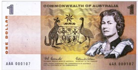
Figure 17, Coombs/Wilson $1 AAA 000107.

Decimal notes commenced on 14 February 1966, with $1 at AAA, $2 FAA, $10 SAA and $20 XAA. $5 notes commenced in 1967 at NAA, $50 in 1973 at YAA and $100 in 1984 at ZAA. Fig. 17 is a low numbered note not among the 25 th anniversary notes, having been extracted prior to the creation of the sets. Letters I, O, M and W were initially not used, with M and W later used for $10 and $50 notes respectively. Some prefixes were also later re-used in other denominations such as “R” from $10 notes and “A” from $1 notes for the $20 denomination.