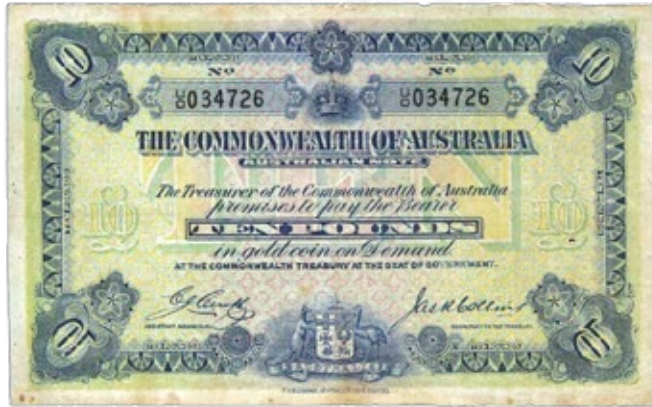
Figure 9, Cerutti/Collins U/0 prefix £10.

Treasury-issued £10 notes commenced with prefix “W” in Collins/Allen issues then into Cerutti/Collins notes with “W” as a prefix and then “W” as a suffix. For a very short period the series continued with U over 0 prefix, which remained unconfirmed for decades, with only one such note known to have survived (Fig. 9).