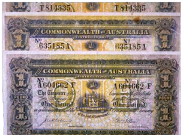
Figure 6, £1 Collins/Allen notes with large black serials. Collins/Allen £1 notes then continued with large seriffed black serial numbers with the prefix “T”, followed by letters A to T as suffixes, then continued with the prefix letter “A” and different suffixes. This system of changing the prefixes continued into the Cerutti/Collins series ending with “E” prefix and suffix ‘C’ (Fig. 6).