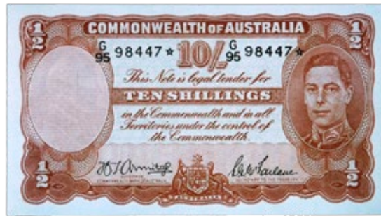
Figure 15, Armitage/McFarlane 10/- star note.

A different style of numbering was used for the legal tender issues from 1933, but still consisted of a single letter over numerals prefix. From 1948 star replacement notes (Fig. 15) were used to replace spoils, firstly with the same prefixes as those being replaced and later by star notes with their own serial number ranges. 10/- and £1 stars were used in King George VI and Queen Elizabeth II issues and £5 stars only appeared late in the Elizabeth II notes. The Queen Elizabeth II general issues from 1953 used two letters over two numbers prefixes with 10/- commencing AC, £1 HA, £5 TA and £10 WA.