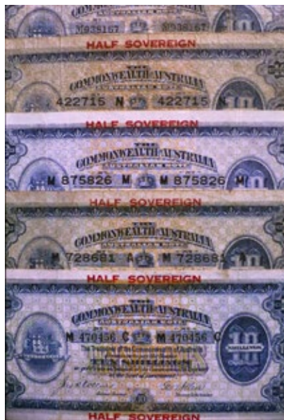
Figure 4, the five serial number types of Collins/Allen 10/- notes.

The first ten shilling banknote serial numbers with the prefix letter “M” were printed in red (Fig. 2) and later in black, followed by the prefix “N”. Forgeries of the first ten shilling notes prompted the mosaic overprinting of the backs, and “half sovereign” was printed in red on the four borders on the front of the notes. With only two million ten shilling notes possible using “M” or “N” as a prefix, other ways had to be devised to continue using the same letters. The next two million ten shilling notes were given the suffix “M” or “N” and the next two million M (number) M and N (number) N. Numbers then commenced with the prefix M and a different letter suffix and then N with a different letter suffix. For a short period notes of Collins/Allen and Cerutti/Collins bore serial numbers from a different numbering machine designated as “seriffed” (bottom note in Fig. 4). Bold type was used for the balance of the series.