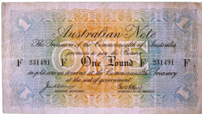
Figure 8, Emergency “Rainbow” pound.

A year or so after the £1 notes commenced there was a shortage of note paper from England due to WW1. Two types of emergency £1 notes were locally produced. The first of these was an unused 1894 English, Scottish & Australian Bank Limited £1 overprinted in a similar fashion to the previous superscribed notes, but without the decorative panels and only two serial numbers instead of three, using serial numbers A (number) A and B (number) B, (Fig. 7).