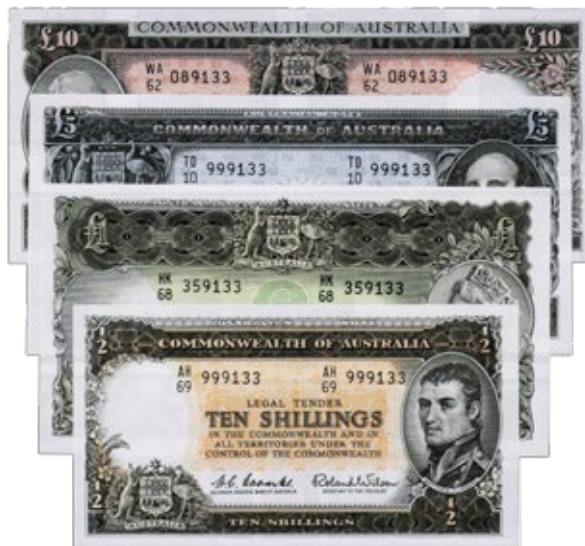
Figure 16, last of Queen Elizabeth issues from 25th Anniversary portfolio.

During this series the Reserve Bank of Australia (R.B.A.) was created by the Reserve Bank Act of 1959 and came into operation on 14 January 1960 as Australia's central bank. Banknotes were thereafter issued by the Note Printing Branch of that bank, and later by Note Printing Australia, a wholly owned subsidiary of the R.B.A.