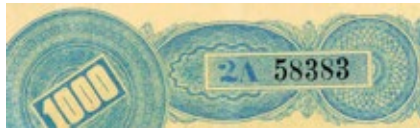
Figure 3, serial number of Kell-Collins £1,000 note.

The first ten shilling banknote serial numbers with the prefix letter “M” were printed in red (Fig. 2) and later in black, followed by the prefix “N”. Forgeries of the first ten shilling notes prompted the mosaic overprinting of the backs, and “half sovereign” was printed in red on the four borders on the front of the notes. With only two million ten shilling notes possible using “M” or “N” as a prefix, other ways had to be devised to continue using the same letters. The next two million ten shilling notes were given the suffix “M” or “N” and the next two million M (number) M and N (number) N. Numbers then commenced with the prefix M and a different letter suffix and then N with a different letter suffix. For a short period notes of Collins/Allen and Cerutti/Collins bore serial numbers from a different numbering machine designated as “seriffed” (bottom note in Fig. 4). Bold type was used for the balance of the series.