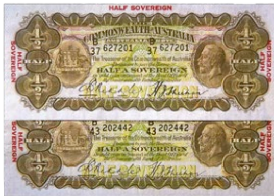
Figure 14, Riddle/Sheehan 10/-, thick and thin Sheehan signatures.

Harrison £10 notes commenced at U over 1 for Kell/Collins notes and ended at U over 4 for Riddle/Sheehan (gold) notes. These were all “Commonwealth Bank” issues with only one specimen note known with the “Chairman of Directors Note Issue Dept.” title (Fig. 13).