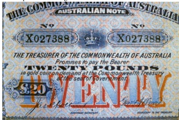
Figure 10, Collins/Allen £20, prefix letter X.

Treasury-issued £20 notes commenced with prefix “X” for Collins/Allen (Fig. 10), then again with Cerutti/Collins notes before continuing as suffix “X” (Fig. 11).