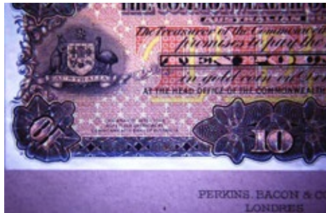
Figure 13, Note Issue Dept. title specimen £10.

Harrison £5 notes commenced at Q over 0 in small prefixes for Kell/Collins notes, and ended at Q over 29 in large prefixes for Riddle/Sheehan notes. Some early issues had Note Issue Dept. signature titles and others Commonwealth Bank titles.