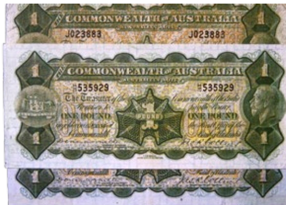
Figure 12, Harrison £1 issues, large and small prefix, Harrison imprint and no imprint.

From 1923 new “Harrison” note designs were issued by the Note Issue Department of the Commonwealth Bank of Australia. They were designed by the Australian Note Printer, Thomas Samuel Harrison, recruited by the Australian Government from Waterlow and Sons in England to set up the Note Printing Branch in Melbourne in 1913.